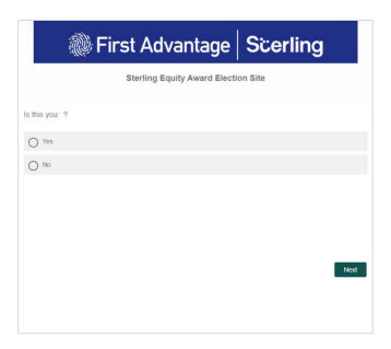
Screenshots are for Illustrative Purposes Only.