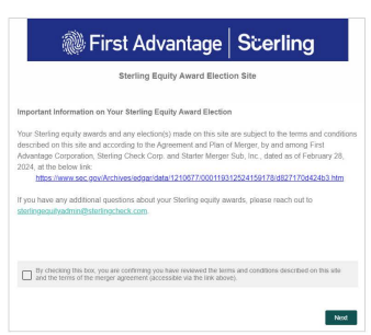
Screenshots are for Illustrative Purposes Only.